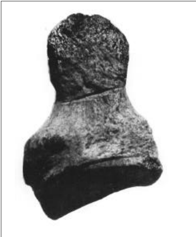
Mastodon phalange (toe bone) with deep cut encircling the base, found in the El Horno excavation. (Armenta, 1978, fig. 61-1)